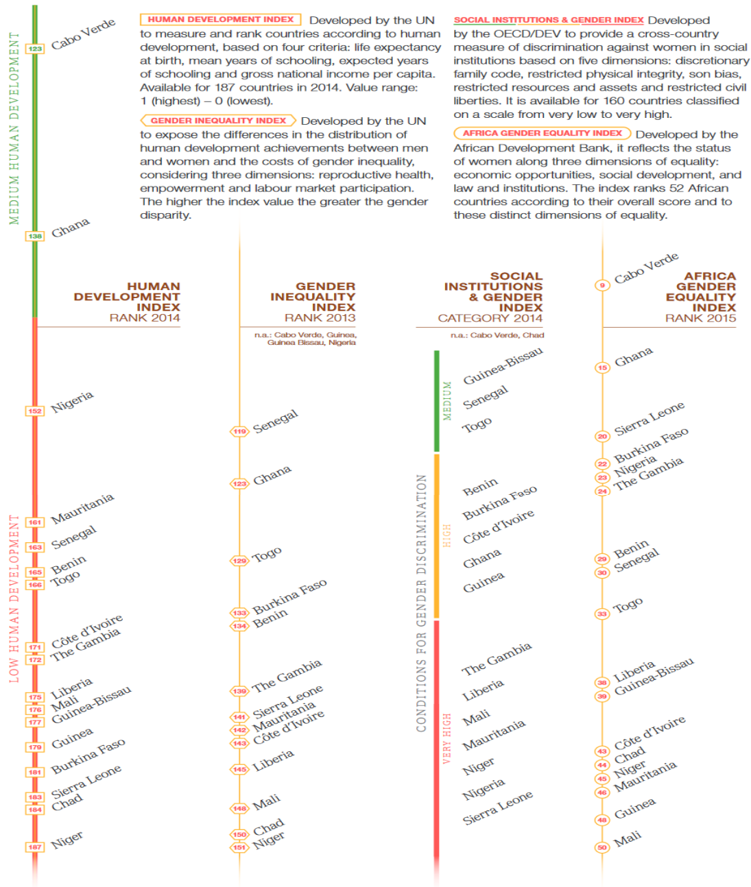
Figure 1: Gender equality indicators